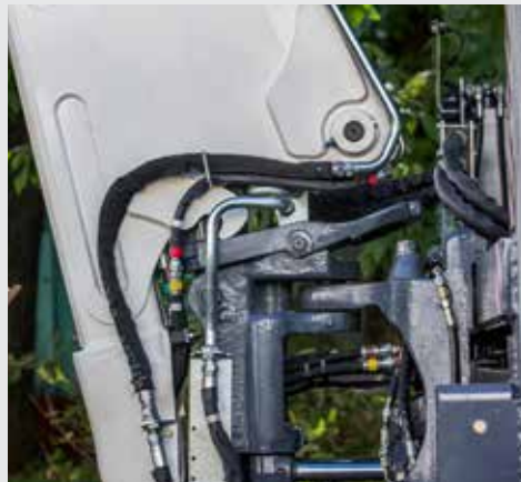
Double-pin boom lock for securing the backhoe boom for transport. This function does not require exit of the operator since it is remotely activated from the operator's cab.