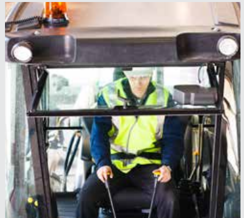
The one-piece rear window opens easily and can be locked open making a rain canopy and ensuring comfortable environment during a warm period.