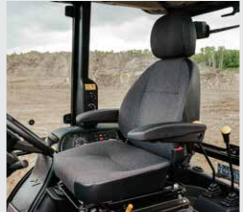
Comfortable adjustable high-back operator's seat with armrests, headrest and retractable seat belt.