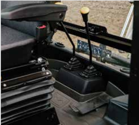
Ergonomic pedal to control the breaker and telescopic stick. It substantially reduces the operator's fatigue.

The synchronized 4-speed SynchroShuttle gearbox enables shifting while in motion and change the driving direction.