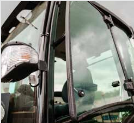
The upper parts of the doors can be fully opened and locked for better ventilation.