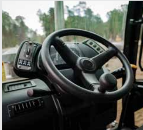
Tilt steering column. Ergonomic steering wheel that does not require significant efforts from the operator when maneuvering. The wheel has a wheel spinner to help make steering with one hand less difficult & faster.